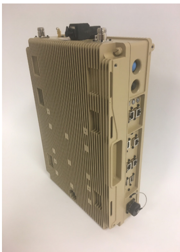
Xiphos ® Micro 3

From remote battlefield operations to urban emergencies, mission success depends on optimal situational awareness. Xiphos ® Micro delivers a mobile and reliable broadband network when communications infrastructure is inadequate, damaged or non-existent in the most challenging environments.